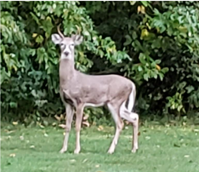
Yes, he lives at Pine!