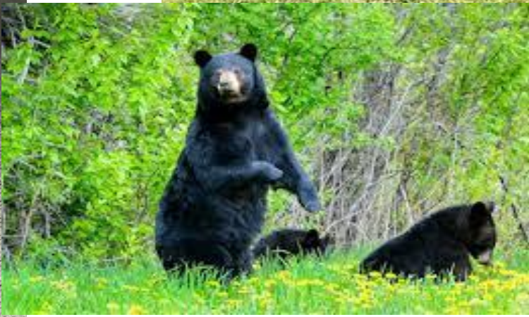
Hey! How did that picture get in here?! No, black bears don't live here anymore, but one did make its way through Michigan City a few years ago!